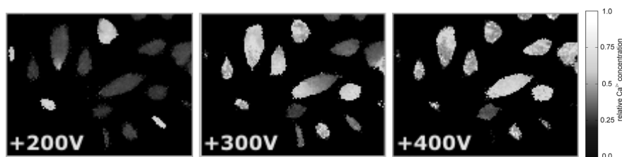
Figure 2: Cells stained with Fura-2AM and exposed to electric pulse with increasing amplitude.

Using a BetaTech device, deliver one electric pulse of 100 μs with voltages varying from 150 to 300 V. Immediately after the pulse, acquire two fluorescence images of cells at 540 nm, one after excitation with 340 nm and the other after excitation with 380 nm. Divide these two images in MetaFluor to obtain the ratio image ( R = F_{340}/F_{380} ). Wait for 5 minutes and apply pulse with a higher amplitude. After each pulse, determine which cells are being electroporated (Figure 2). Observe, which cells become electroporated at lower and which at higher pulse amplitudes.